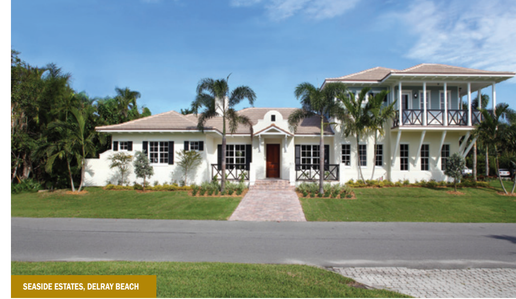
SEASIDE ESTATES, DELRAY BEACH

Upcoming projects for Seaside Builders include eight Townhomes on Venetian Drive and Ingraham Avenue (two blocks from the beach and two blocks from Atlantic Ave). They are set to break ground on February 2013. Each