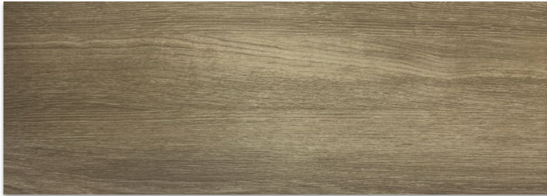
FLOORING THROUGHOUT WOOD PLANK PORCELAIN TILE