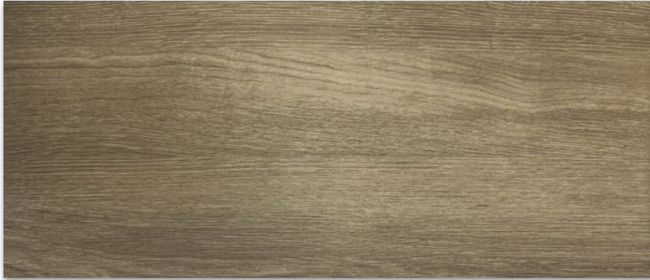
FLOOR WOOD PLANK PORCELAIN TILE